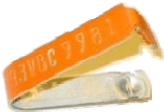
USDA Orange OCV Tag