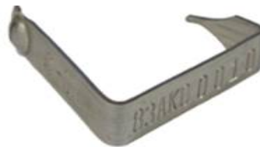
USDA Silver Metal Tag